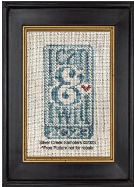
Silver Creek Samplers ©2023 *Free Pattern not for resale

DESIGN AREA: 36 x 68 28 CT over 2.....2 1/2" X 4 3/4" 30 CT over 2.....2 3/8" X 4 1/2" 32 CT over 2.....2 1/4" X 4 1/4" 36 CT over 2.....2" X 3 3/4" 40 CT over 2.....1 3/4" X 3 3/8"